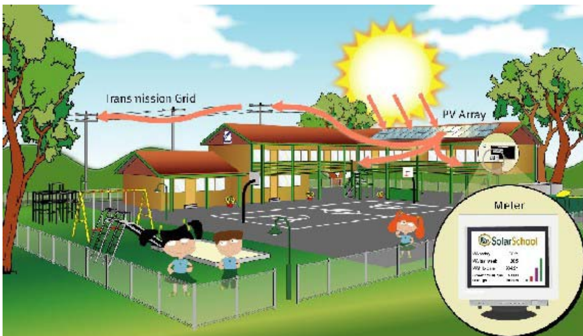
SOLAR SCHOOL FLOWCHART - DAY

Mr Gary Fenlon, Member for Greenslopes representing the Minister for Environment officiated at the ceremony with a number of local dignitaries present. The Wanpa-rda Matilda Outback Education Centre was one of the venues chosen to participate in the Solar Schools' Pilot Program to receive $25,000 worth of solar panels. The installation of solar panels will enable the centre to reduce the amount of power the centre uses from the electricity 'grid' and save in operational costs substantially. The Australian Workers Heritage Centre site currently comprises a powerhouse display, solar powered streetlights, solar lights for the barbecue shelter and solar powered pump that circulates the water in the billabong. The centre continues to source energy efficient items that are environmentally friendly.